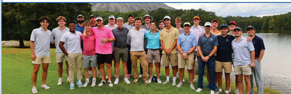
Our golf tournament attendees.

PRSR STD U.S. POSTAGE PAID MAILED FROM ZIP CODE 66044 PERMIT #570