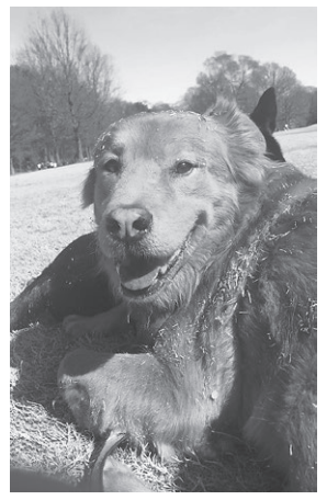
Dylan the Dog

Not many people (or dogs) on campus didn't know Dylan; women especially loved him and mailmen especially hated him. During his time living at 205 4th street he was best friend to nearly