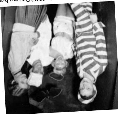
page 2 for details... the best in upcoming issues of the Gazette. See areat times with us, and we'll publish the best of والعام المالية المالية المعادي الم the stories and pictures to prove it? Share your Did you have a great time in ATA? Do you have

We want to know what's new with you too! Share your update and photos online at www.atogatech.org.