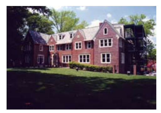
We decided to attack some of the house problems now with some of the funds beginning to flow from pledges made earlier this year.

✓ Install routine maintenance systems with inspections and accountability.