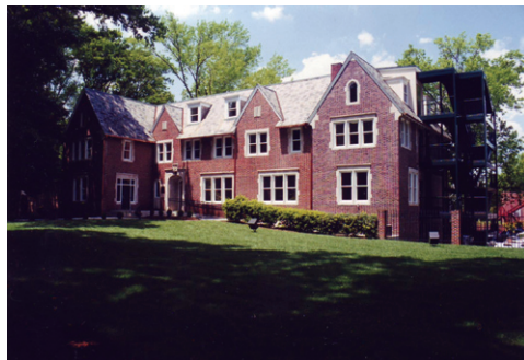
This past summer we initiated a major effort to reestablish a new living and learning environment at the ATO House.